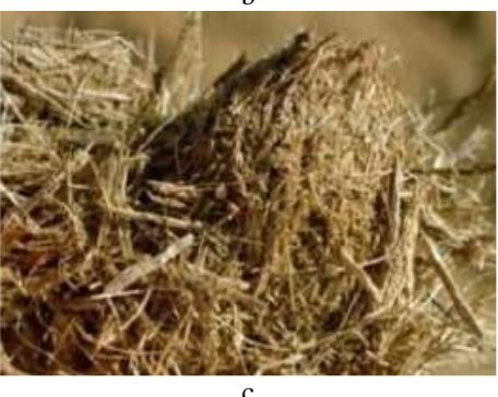
a – timber cellulose; b – cotton cellulose; c – sugar beet pulp cellulose